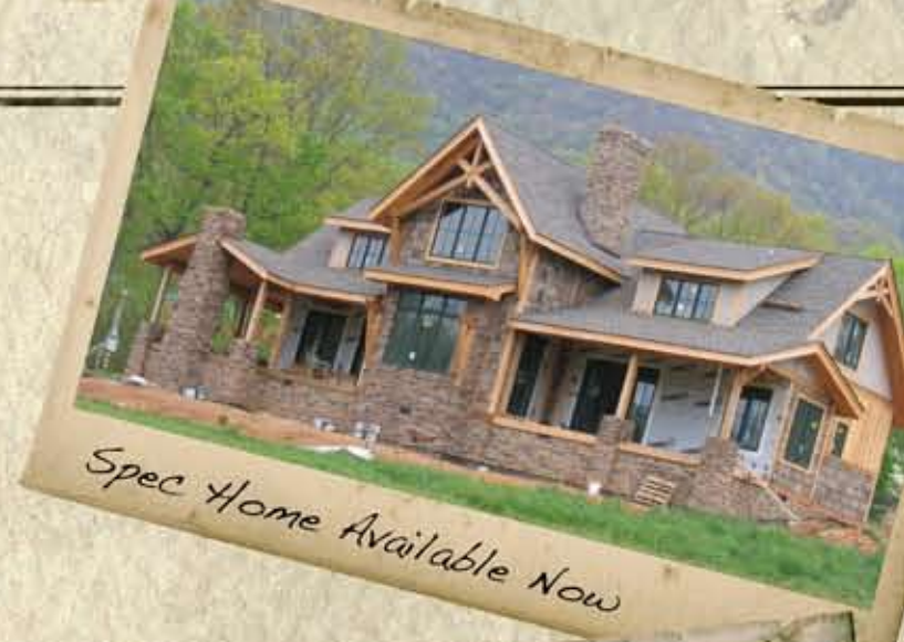
Spec Home Available Now

55 Acres of Common Space • Five Acre Riverfront Park Community Pavilion • 30 Mile, Long Range Views Elevations Reaching 4,600 Feet