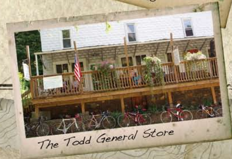
The Todd General Store