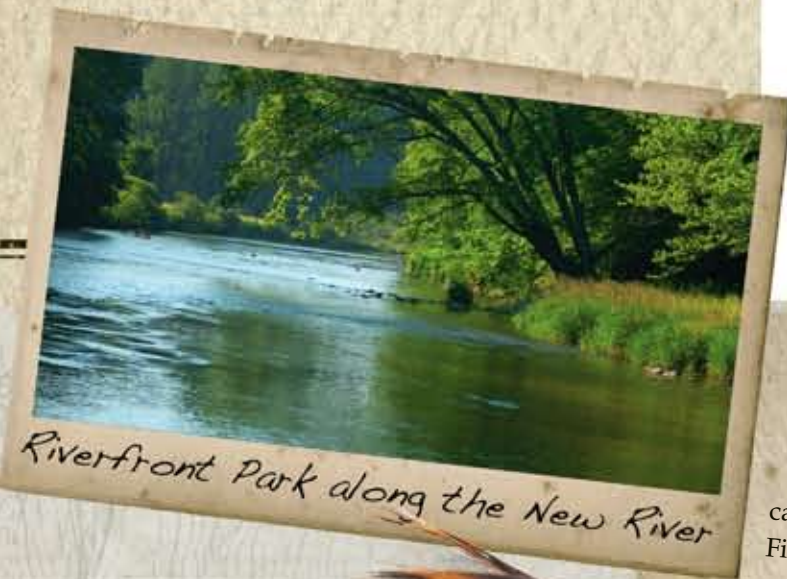
Riverfront Park along the New River

ELK CREEK MOUNTAIN 133 ECHOTA PARKWAY, BOONE, NC 28607 WWW.ELKCREEKMOUNTAIN.COM