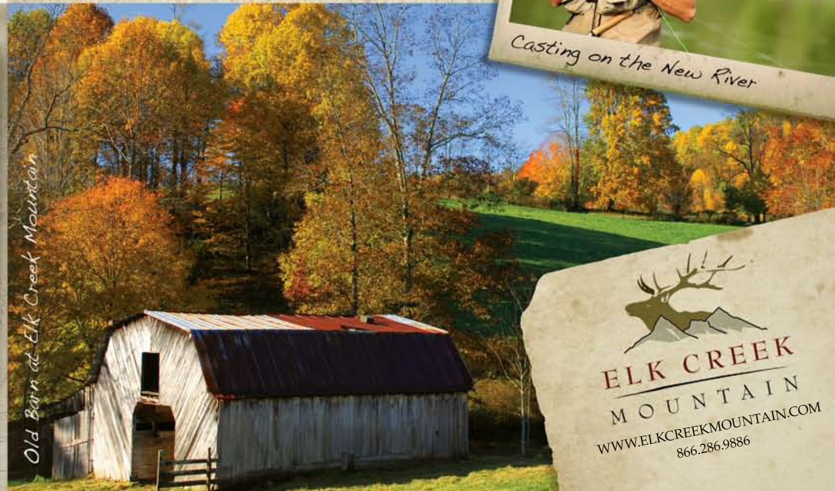
Old Barn at Elk Creek Mountain