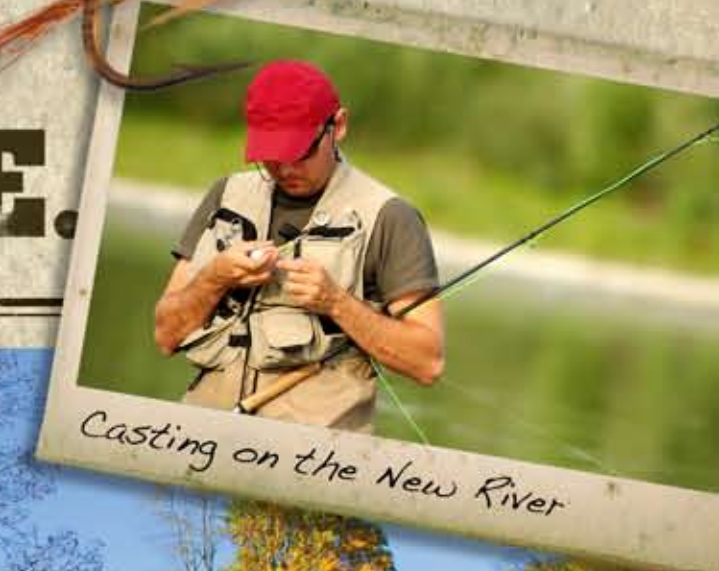
Casting on the New River