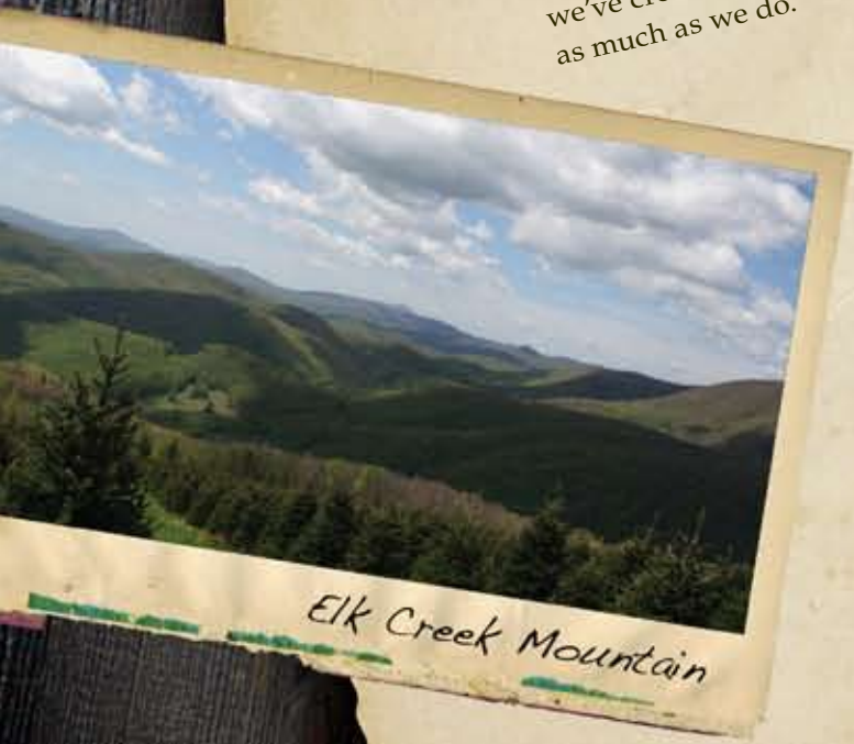
Elk Creek Mountain